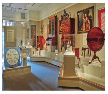
Exhibit Room.

Attendees using air transportation should use Phila delphia, PA (PHL) airport. No shuttle service is available from the airport to the hotel, so attendees should anticipate either renting a car or using ride-hailing services. Likewise, no service from the hotel to the conference site or dinner venues is anticipated, so attendees are encouraged to pair up with other attendees who do have transportation.